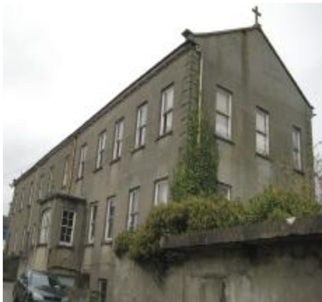
Community Centre, Main Street, Charleville