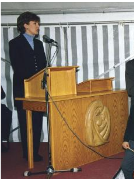
President Mary McAleese speaking to the crowd when she came to open "Santa Maria", Ballylanders in November, 1998.

Our first residence "Ardfern", Smith's Road, Charleville was opened in April 1983 to provide residential accommodation. From then on the Association was committed to providing accommodation as and when necessary and today has eight residences and two retirement homes for adult service users. The Association also has two residences for children and a house for respite care.