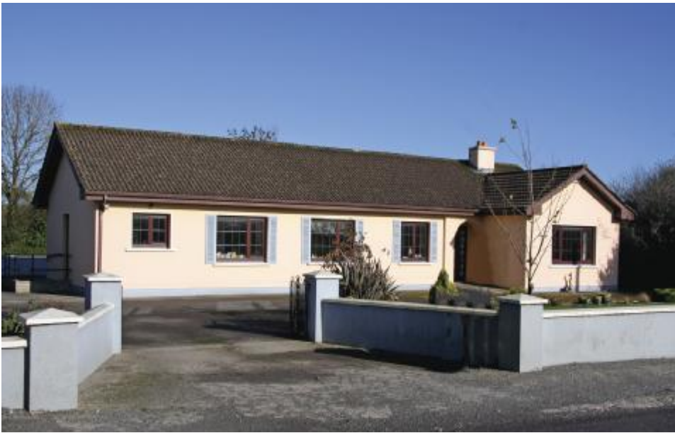
"ARDFERN", Smith's Road, Charleville

Our first residence "Ardfern", Smith's Road, Charleville was opened in April 1983 to provide residential accommodation. From then on the Association was committed to providing accommodation as and when necessary and today has eight residences and two retirement homes for adult service users. The Association also has two residences for children and a house for respite care.