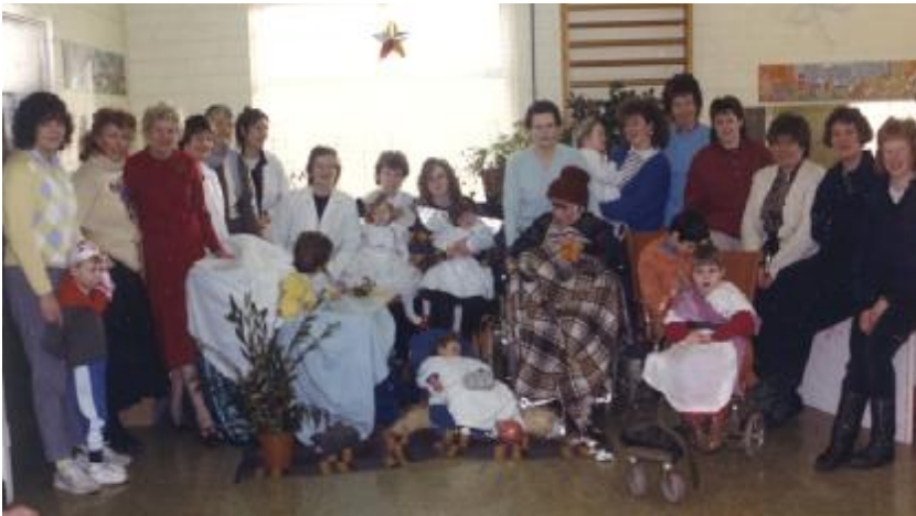
Staff and pupils of the Padre Pio Preschool and Holy Family School circa 1987