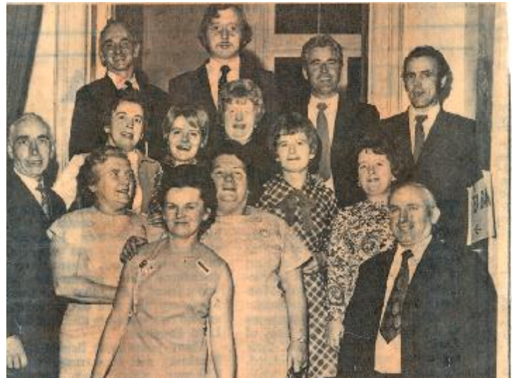
In London a very active group "Charleville and District Emigrants" were responsible for donating

From 1974 to 1978 the Association launched: a lottery which ran for over 10 years, The "Brick and Block" campaign and a Cook Book - "The Community Spirit". All were very successful fundraisers.