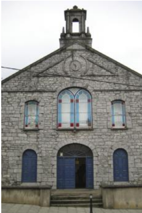
Parochial Hall, Chapel Street, Charleville.