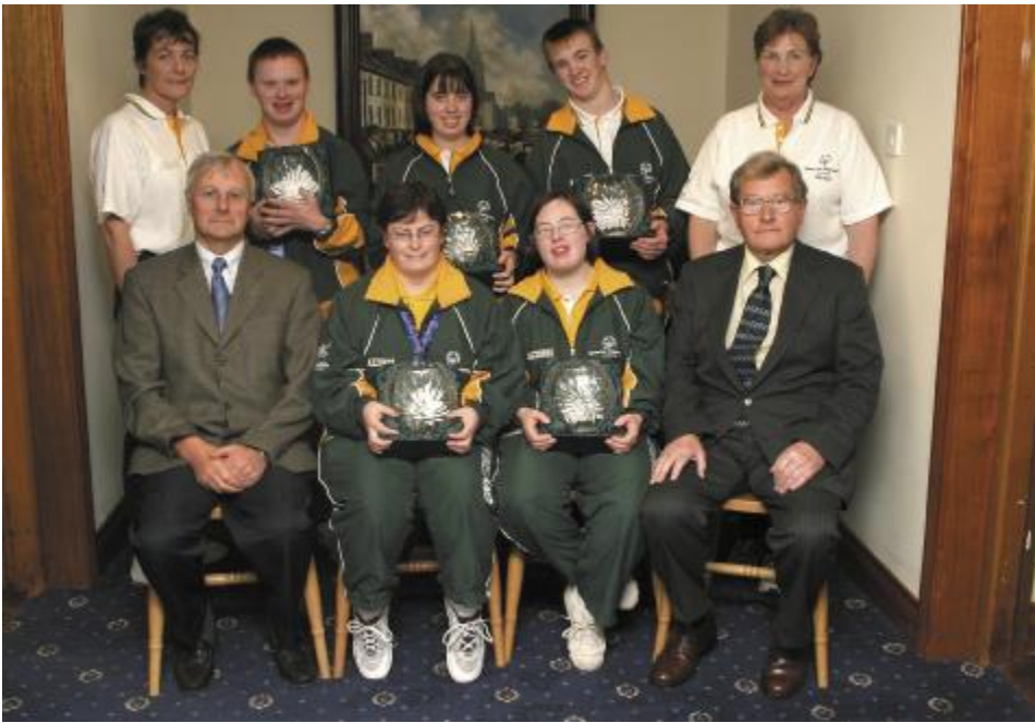
Local members of the Irish Special Olympic Team 2003

One of the most important highlights over the years has been the participation of several of our service users at the Special Olympics World Games, they have visited the U.S.A., Beijing, China and the most notable one of all, the World Games in Ireland in 2003. They have been great ambassadors for the services and for their country and have won many gold, silver and bronze medals. We are all very proud of their achievements and they have brought honour and glory to the services.