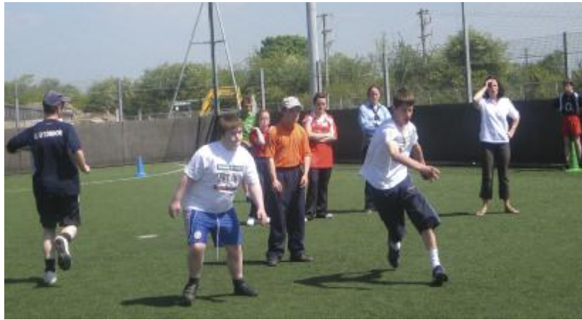
Pupils of H.F.S. getting serious about the girls v boys rounders game.