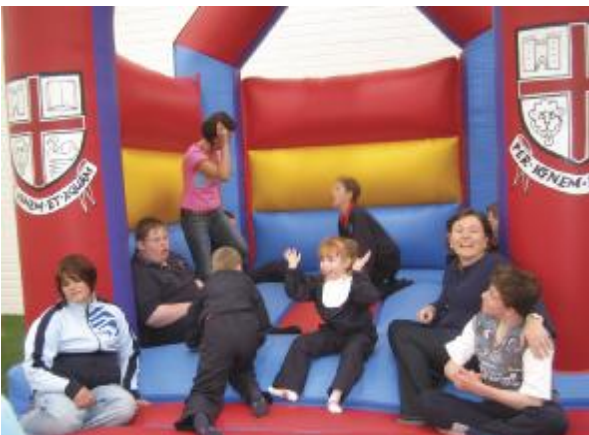
H.F.S. pupils and staff enjoying their day trip to Mallow GAA Complex.