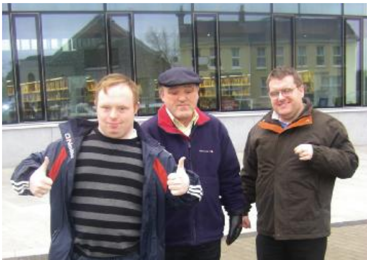
Service users from Craft Dept. visiting the new library in Kilmallock.