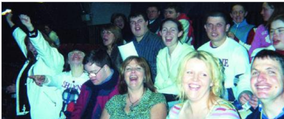
The Forge Night Out at the Shane Ward Concert in Millstreet