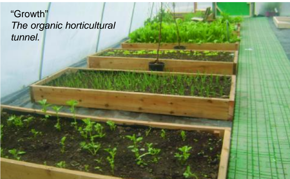
"Growth" The organic horticultural tunnel.

The long winter is finally coming to an end and it is Springtime. We can see the daffodil bulbs which we planted last October flowering and the spring onions we planted in the tunnel are up and will be ready for pulling by the end of April. We hope to have some rhubarb ready for May. The students from Dromcollogher Organic Horticultural College have been back since the weather improved to help us with our work in developing the garden. We are looking forward to and planning for the summer ahead and hope it will be as good as last year.