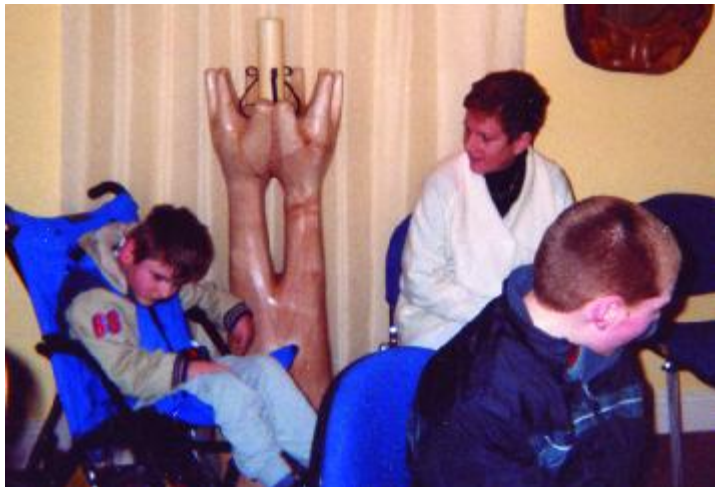
Pupils from Special 3 in the Prayer Room with a visitor from the Ann Sullivan Centre, Dublin.