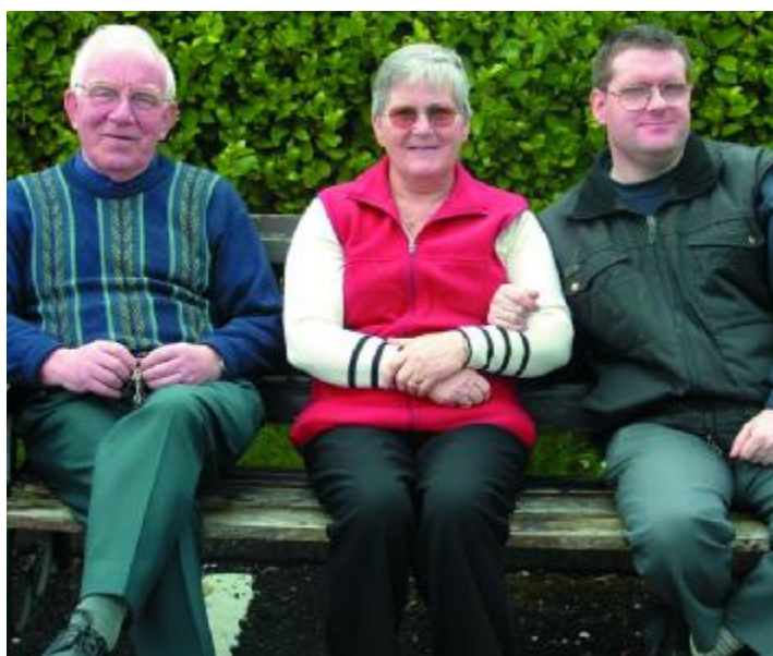
Taking a rest at this year's Spring Fair