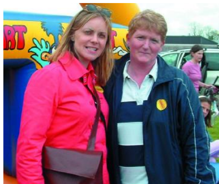
Enjoying the Spring Fair