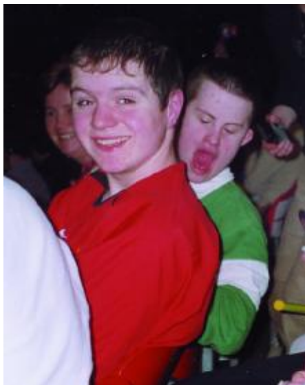
Some familiar faces in the crowd at the "West Life" concert in Millstreet.