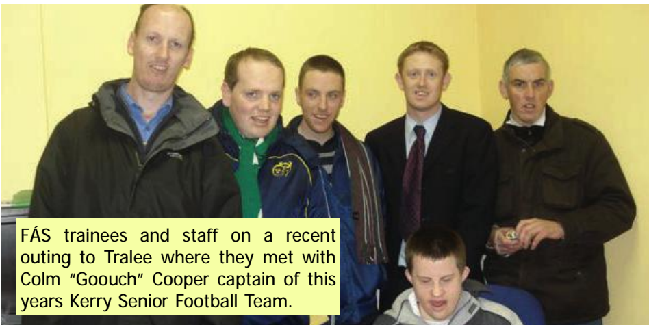
FÁS trainees and staff on a recent outing to Tralee where they met with Colm "Gooch" Cooper captain of this years Kerry Senior Football Team.