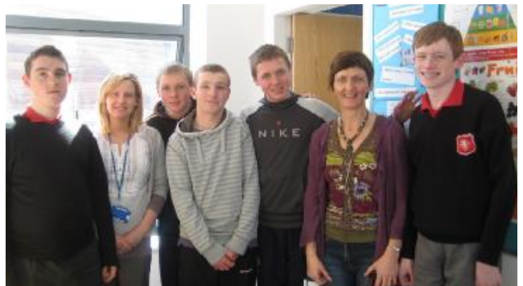
The Green Committee, Holy Family School.