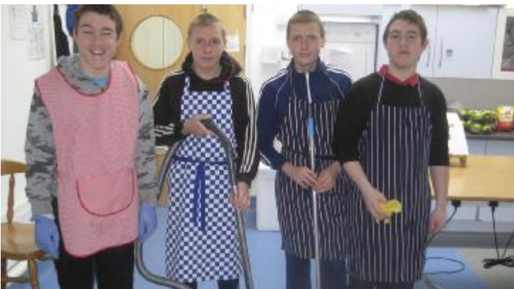
All set to do some "Spring Cleaning"