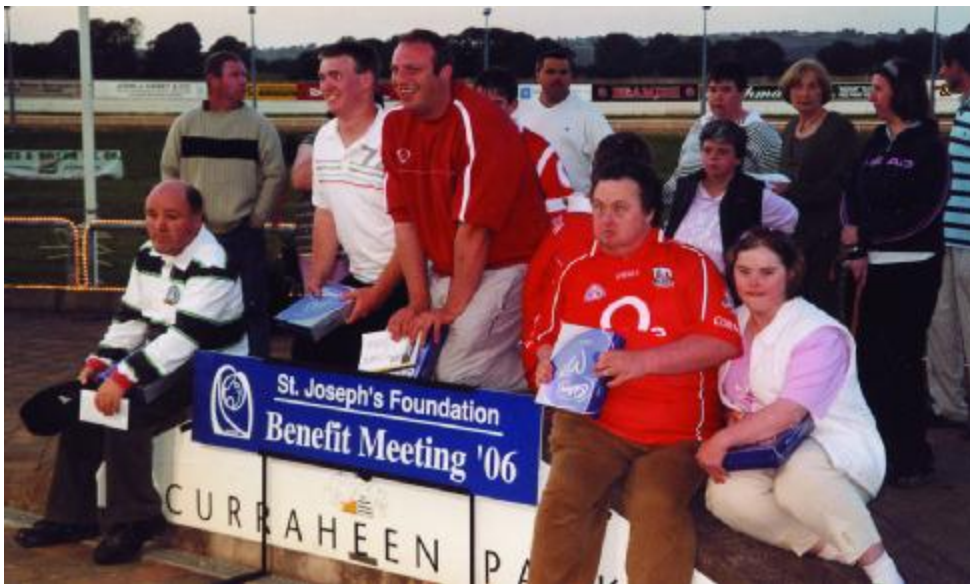
Service users, staff and friends of St. Joseph's Foundation enjoying our Greyhound Benefit Meeting.