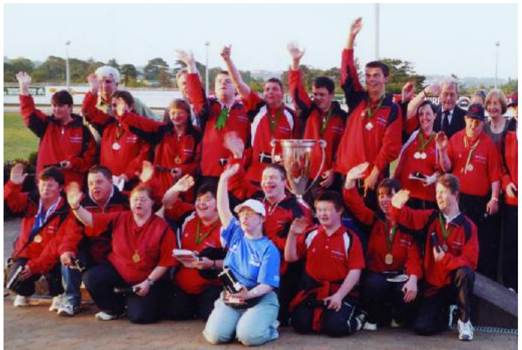
St. Joseph's Foundation service users and staff celebrate with the Heineken Cup at the very successful Annual Greyhound Benefit Meeting held at Curraheen Park, on Thursday, 13th July 2006.