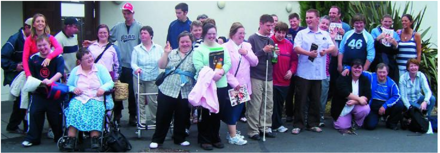
Service users and staff from T.E.S.S. and the Work Shop travelled to Dublin to see the Botanic Gardens on August 11th, 2006 and had a wonderful day out.