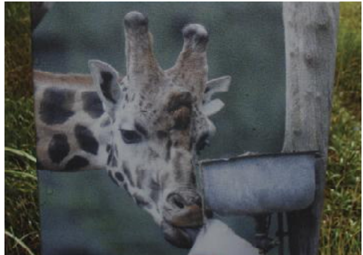
T.E.S.S. service users enjoying their trip to Dublin Zoo during the Summer