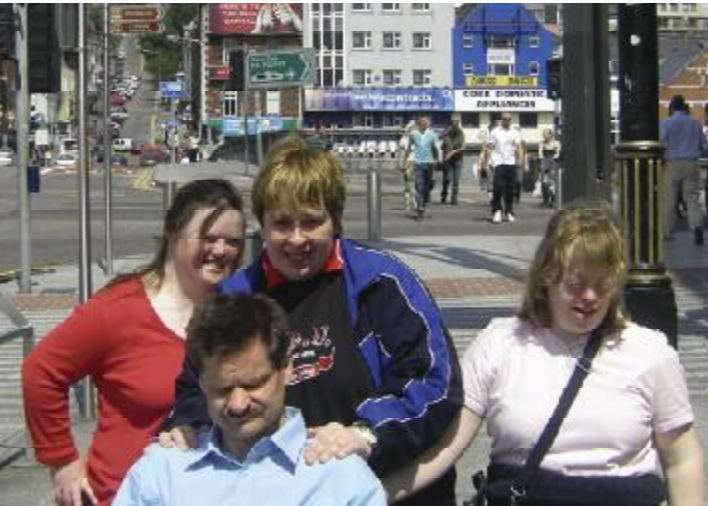
Shopping in Cork City