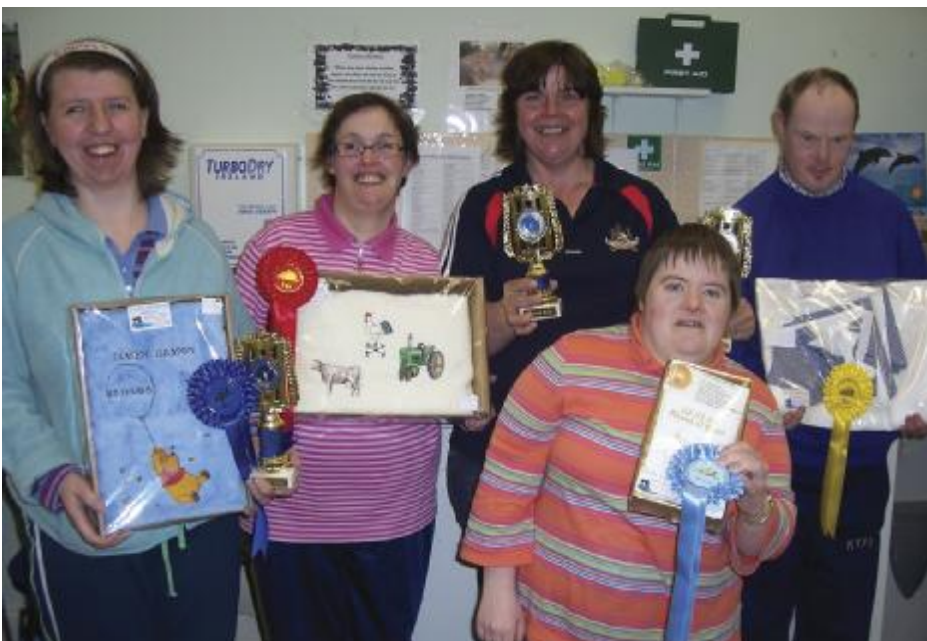
Well done to the Sewing Dept. on winning 1st, 2nd, 3rd prizes and a special prize in the sewing craft section of the Limerick Show which took place at the Limerick Racecourse.