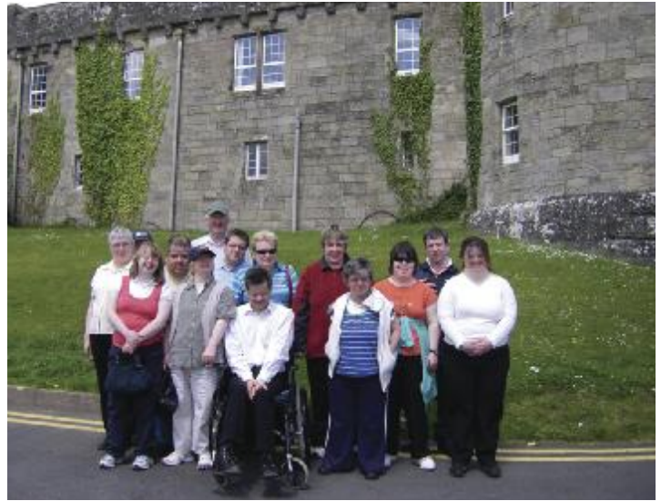
Craft Dept. visits Glenstal Abbey