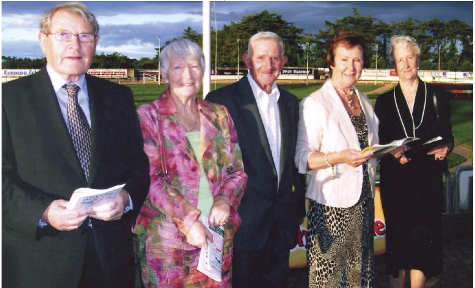
Supporters of St. Joseph's Foundation Greyhound Benefit Meeting enjoying themselves at Curraheen Park, Greyhound Stadium, Cork.