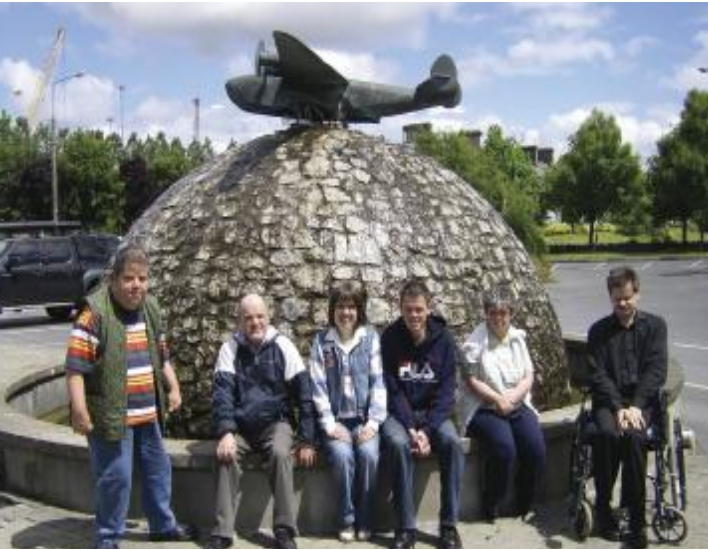
Craft Dept. trip to the Foynes Flying Boat