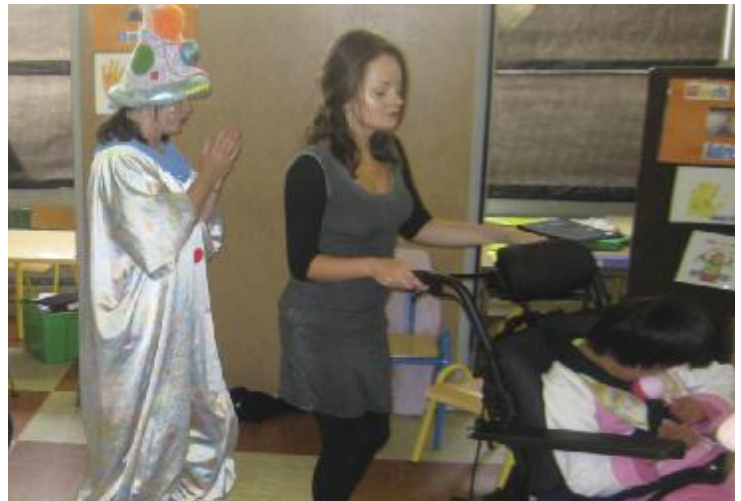
All enjoying the music and dance..